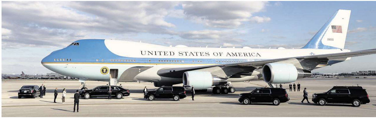
President Joe Biden enters his motorcade after arriving at Miami International Airport on Tuesday.

Florida donors have already poured millions into Biden’s political operation during the past year, with some of the largest