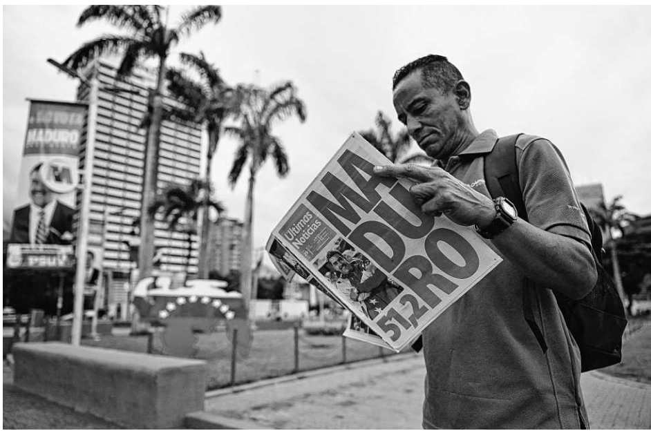
A man reads a newspaper in Caracas on Monday after Nicolás Maduro was declared the winner of Venezuela’s presidential election.