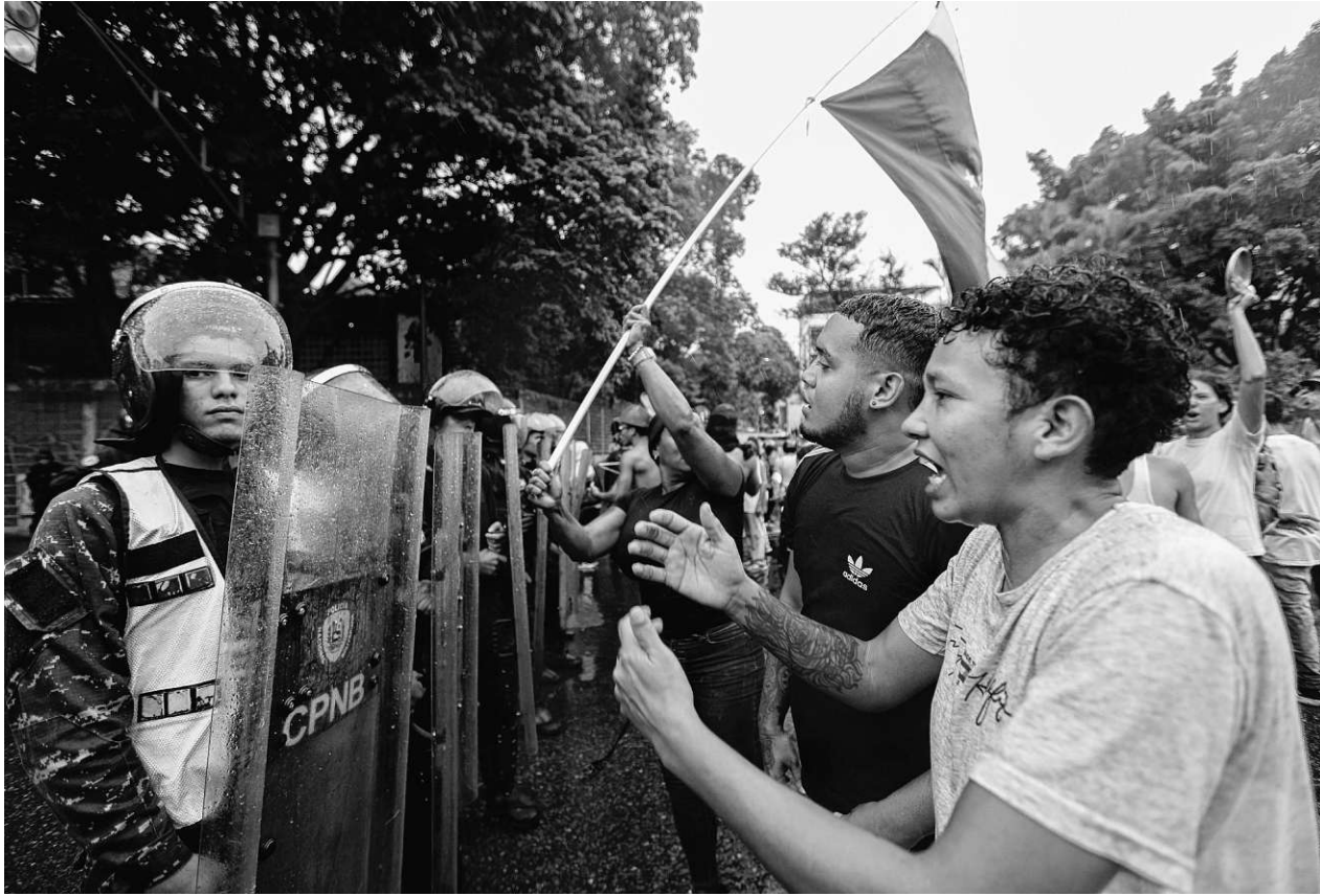
Demonstrators vent their anger on Monday in Caracas.

However, González and his political mentor, María Corina Machado, immediately questioned the results announced by the council, pointing out that the data that they had received directly from the electoral agency, before it halted the process without explanation, showed González with 70% of the vote compared to barely 30% for