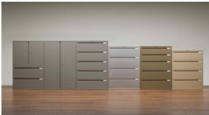
FILING AND STORAGE