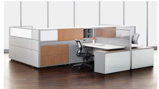
PLANNA AND STORVAL

Inscape gives you the flexibility to design and redesign your own interior landscape. Visit our website at www.inscapesolutions.com to view our entire line.