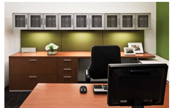
PLANNA PRIVATE OFFICE