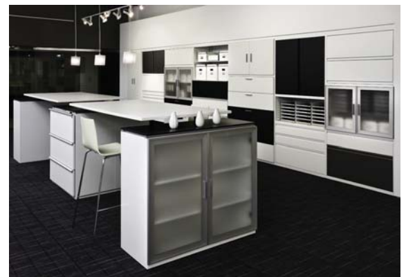
FILE WALL WITH PLANNA