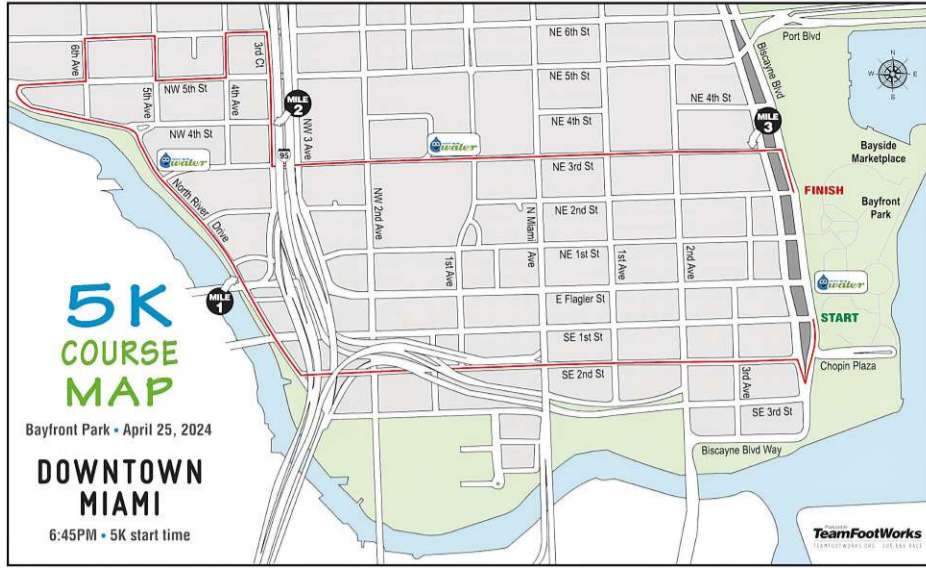
The Lexus 2024 Corporate Run course map for Thursday in Miami

Here are some of the garages you can consider if you're driving to the race. Race officials suggest these then taking the Metromover to get close to the event.