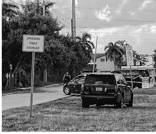
Miami-Dade police officers and federal agents stand outside a gated home near Homestead on Tuesday.

A neighbor who declined to provide her name said Tuesday was the second time officers had descended on the property in recent years.